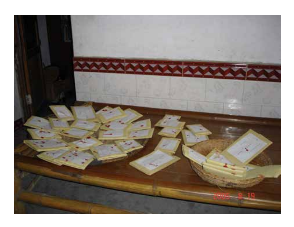
FIGURE 9. Money packages with printed address labels and stained with duck blood.