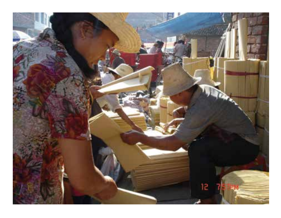
FIGURE 4. Villagers buy packets of spirit money.