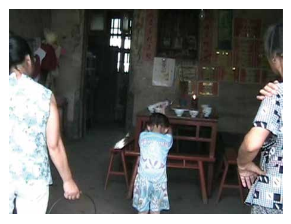
FIGURE 7. A little boy does bai toward the invisible ancestors during xiafan.

After their bai, I picked up a stack of paper money, burned it in front of the tables, some inside and then outside, and set off another string of firecrackers to send them off. The breakfast portion of xiafan was thus completed. Pouring out some tea on the ground from each bowl and putting the rest back in the pot, I collected the bowls on the high tables, then washed and placed them upside down on the tables. Children immediately climbed on the benches, each taking a bun and