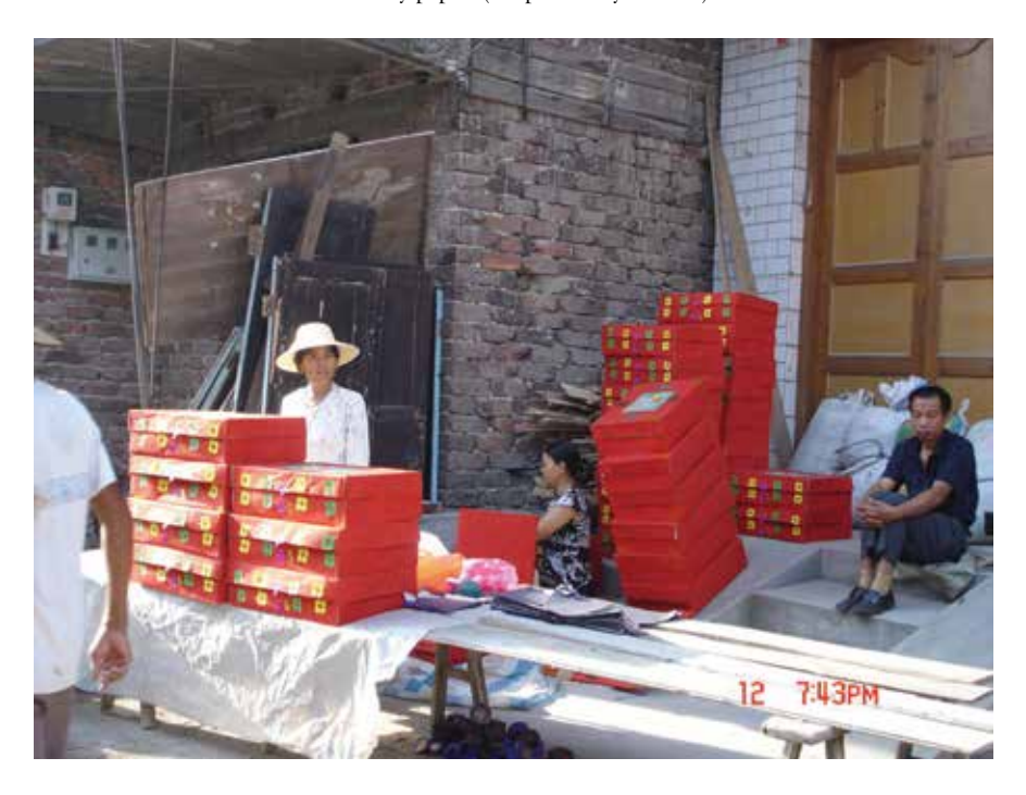
FIGURE 2. A stand of paper boxes.