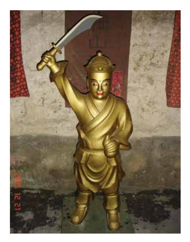
FIGURE 12. The statue of General Meishan in Fanluo Immortal Hall.