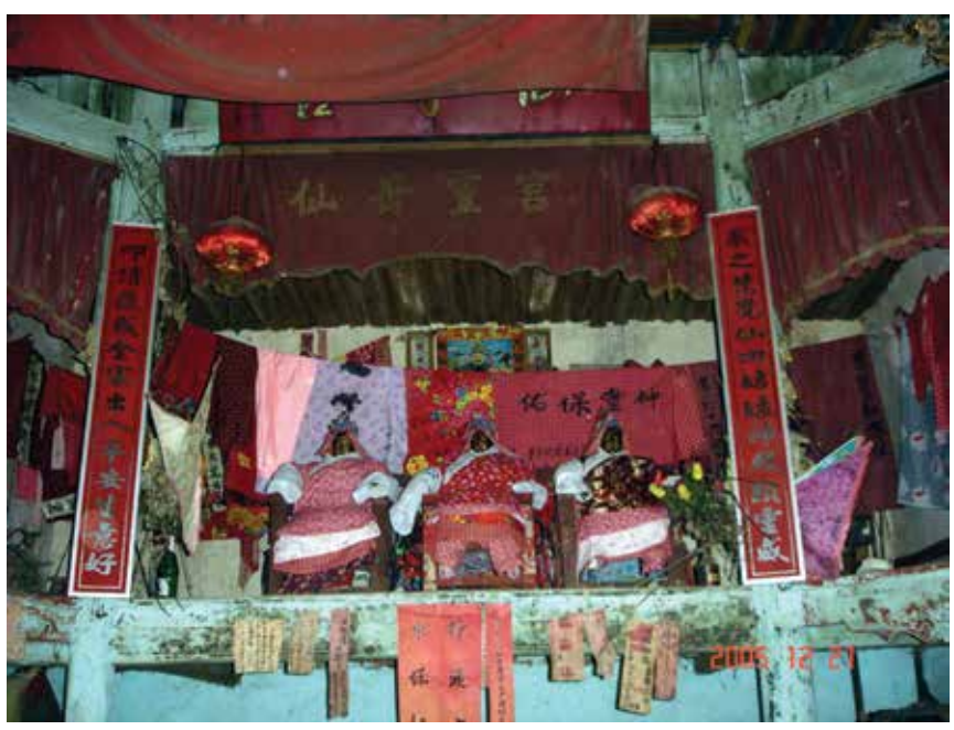
FIGURE 13. Statues of the Three Ladies enshrined in the Fanluo Immortal Hall, each one wearing layers of clothing offered by worshippers.