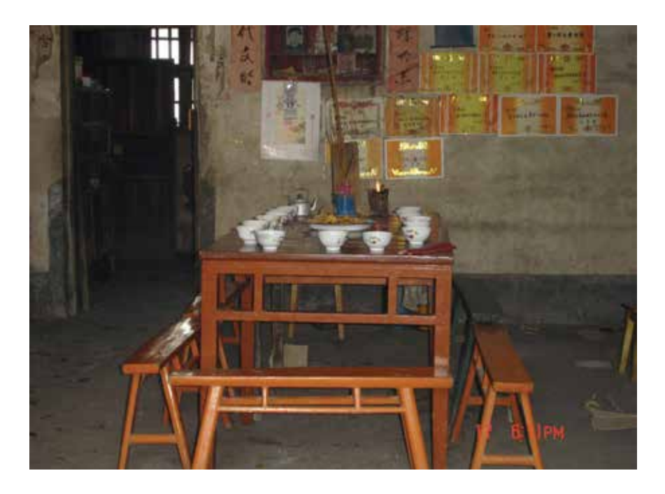
FIGURE 6. Amid the smoke of incense and firecrackers, food is offered to ancestors.

used as an incense pot, and a wooden ancestral tablet facing the front door. All of these items she moved from the altar on the invitation day. We placed three bowls and three pairs of chopsticks on each of the remaining sides and on the outside table. Then we divided the buns onto three plates, two on the inside tables, one on the outside.