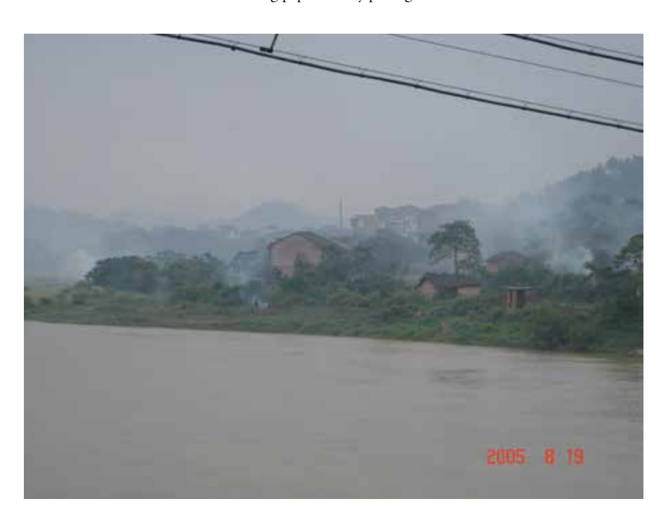
FIGURE II. A village enveloped in the cloud of smoke and ashes of burning paper money.