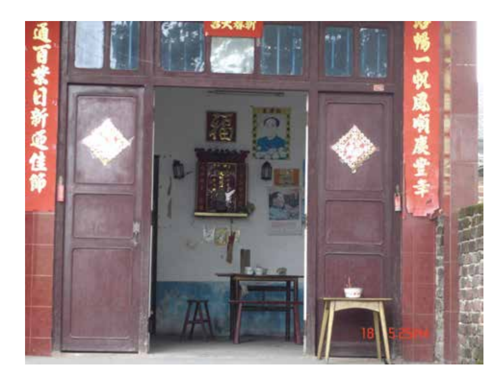
FIGURE 5. The two tables for souls: the inside for ancestors, and the outside for ghosts. The center of the wall facing the opened front door is the domestic altar.

clothing, jewelry, and daily appliances. Like most people, we did not need to buy the large boxes and hence merely got the basic set: some paper money, incense, firecrackers, and a duck (see FIGURES 2, 3, and 4).