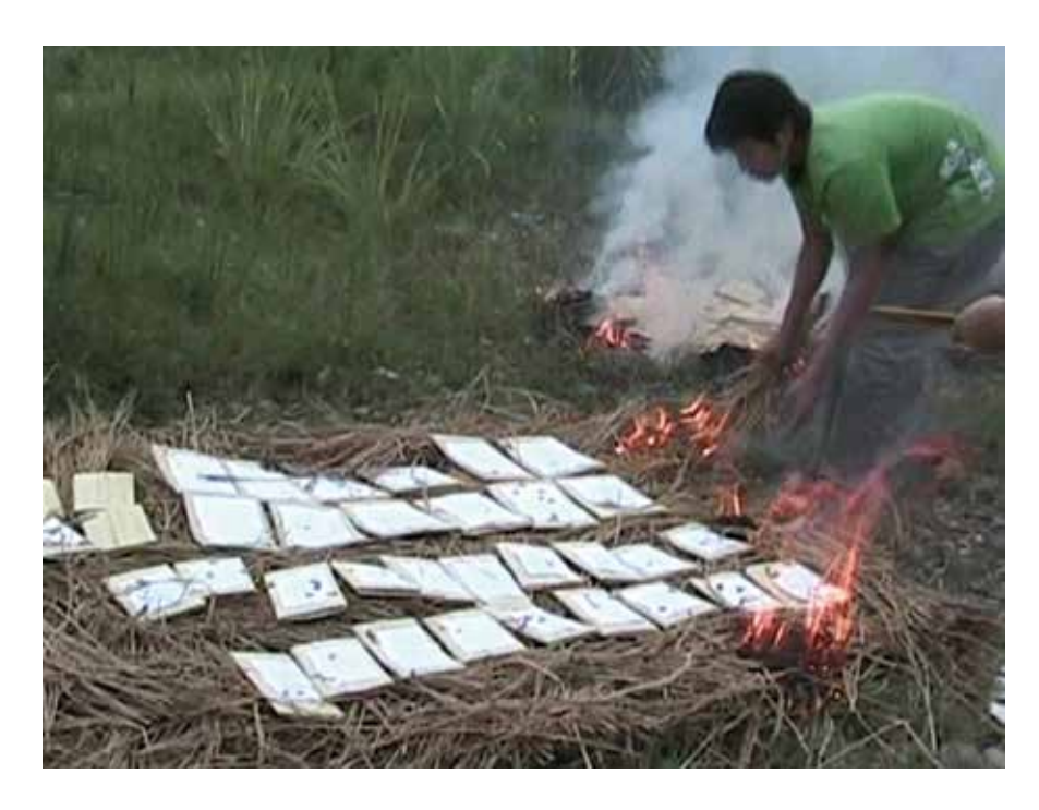
FIGURE 10. Burning paper money packages for ancestors.