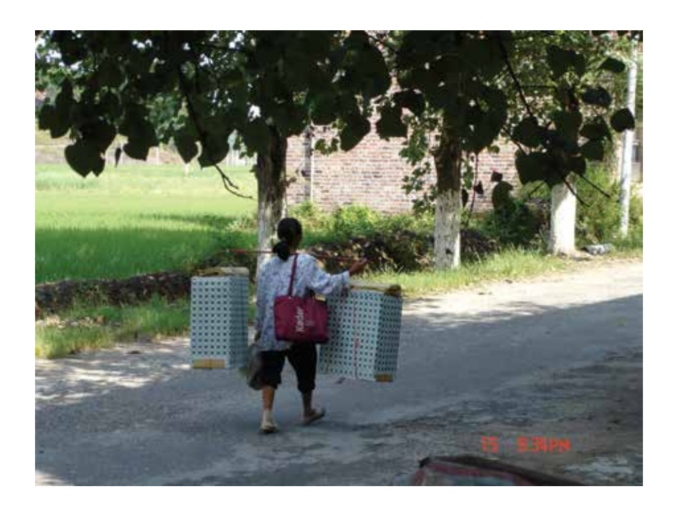
FIGURE I. A woman carries two paper boxes and packets of money paper.