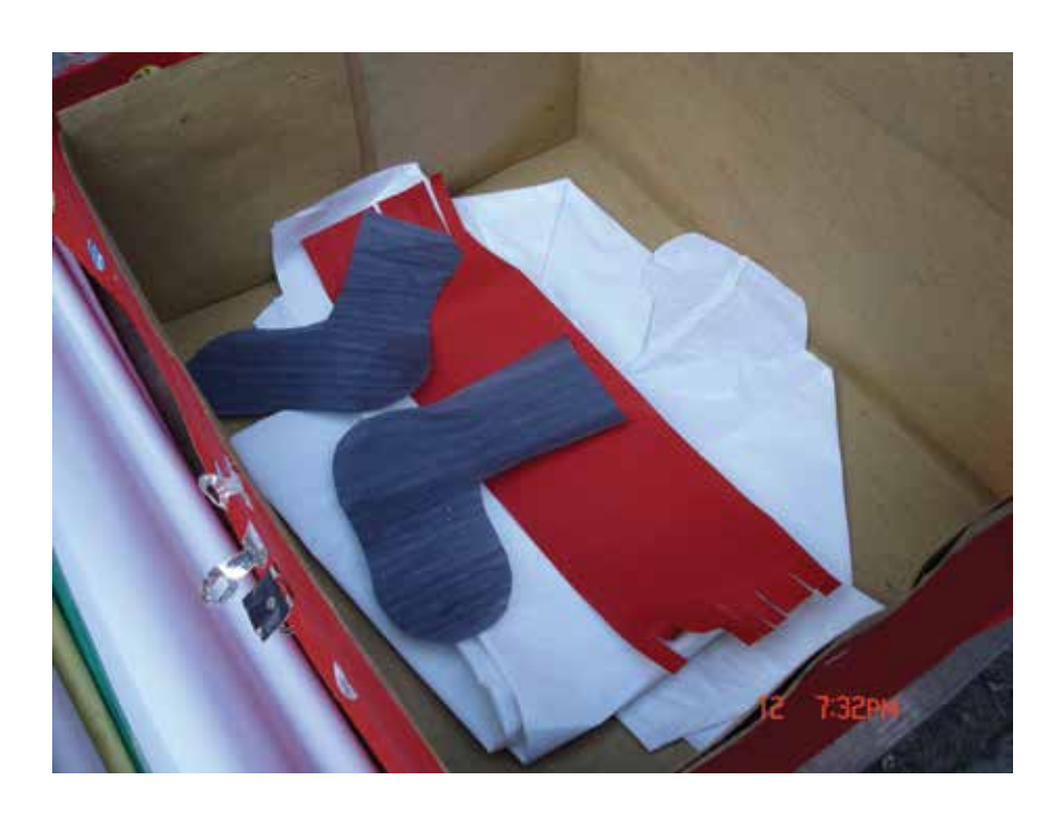
FIGURE 3. The inside of a paper box: clothing and a bath towel.